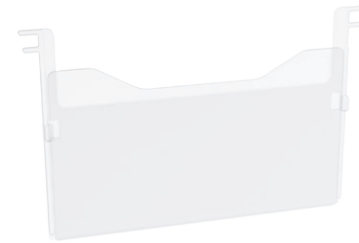
35011 Label Holder