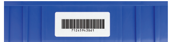
29203 Adhesive Label