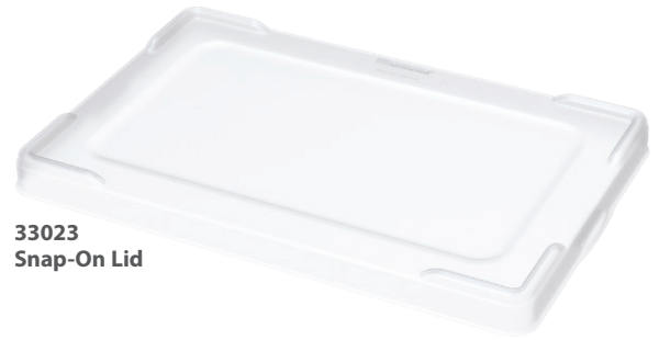
33023 Snap-On Lid