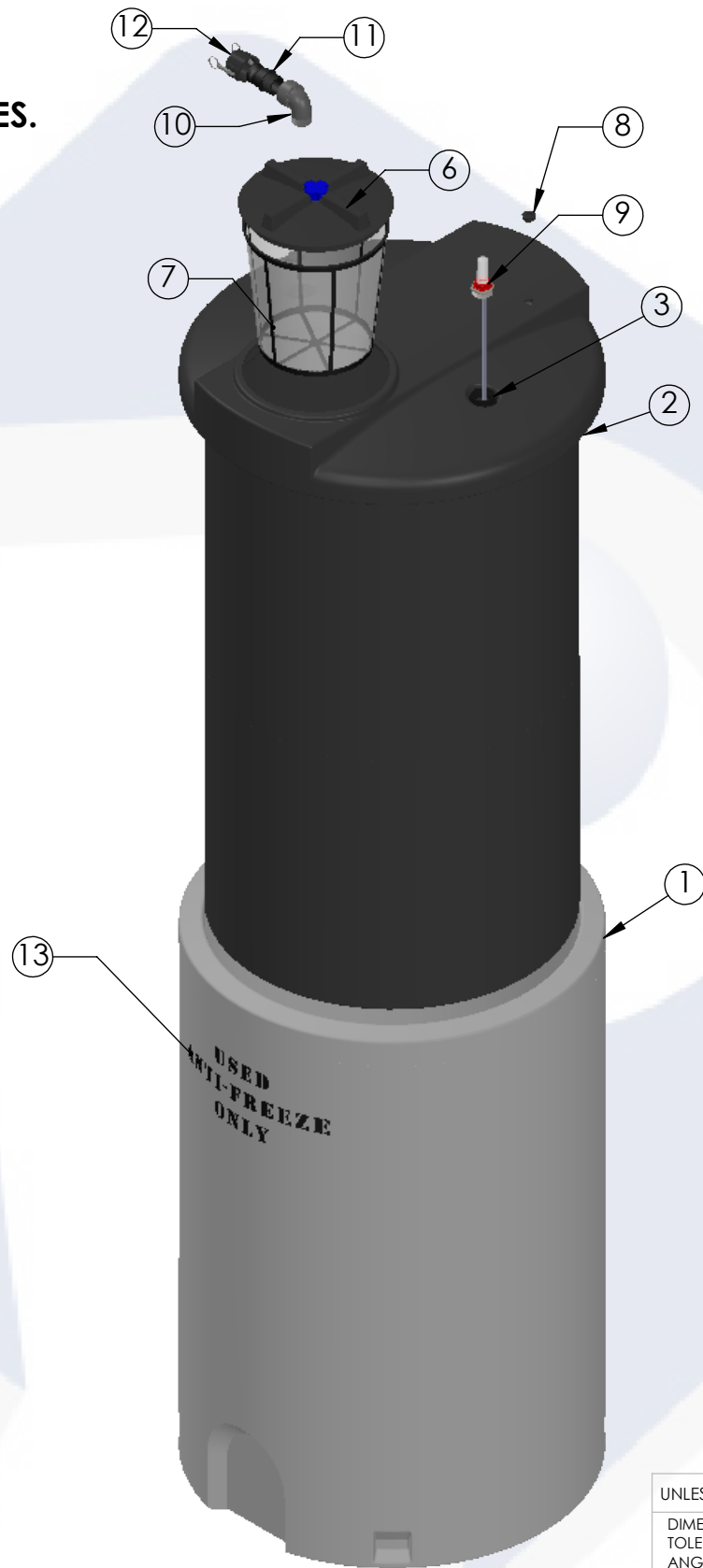
ISOMETRIC VIEW EXPLODED