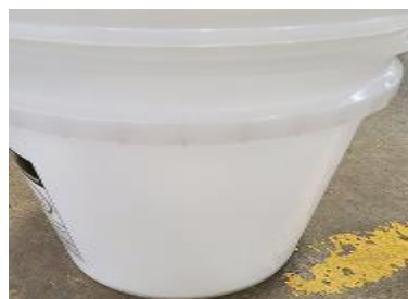
Properly seated M4 lid: