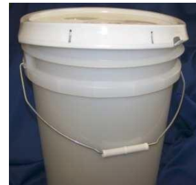
Improperly seated M2 lid: