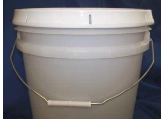
Properly seated M2 lid: