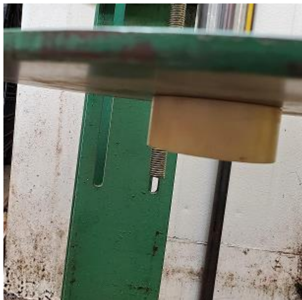
Figure A1: Burper Plug

*To mitigate air entrapment and doming of the lid during production filling, M&M recommends the use of a “Burper Plug” measuring 3” Diameter by 1 ¼” Height attached to the bottom of the capper platen, centrally positioned. (Figure A1)