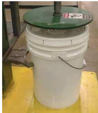
Figure A: Pneumatic Press

*To mitigate air entrapment and doming of the lid during production filling, M&M recommends the use of a “Burper Plug” measuring 3” Diameter by 1 ¼” Height attached to the bottom of the capper platen, centrally positioned. (Figure A1)