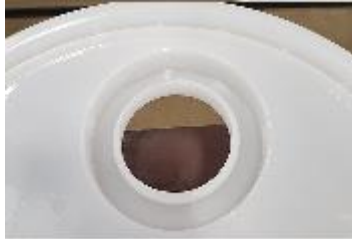
80 mm Screw Cap Lid: