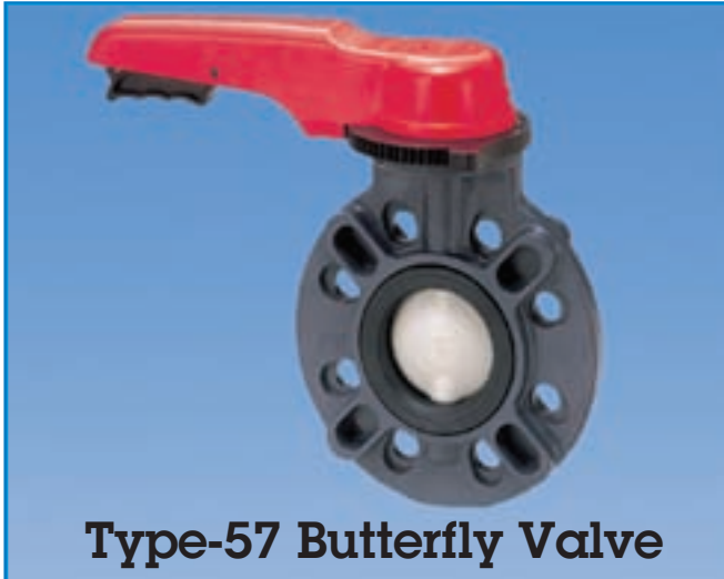
Type-57 Butterfly Valve