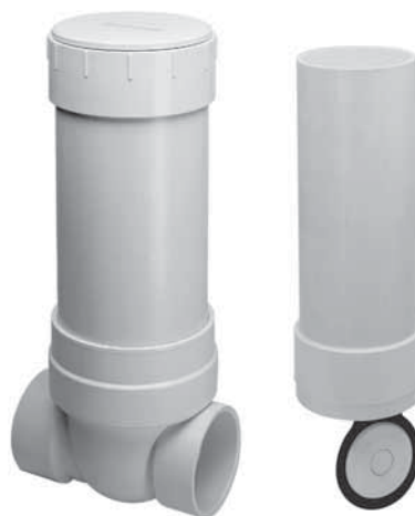
Valve with Extension Kit

Backwater Valves are designed to prevent backflow in numerous applications where easy service access for maintenance and cleaning is needed. Excellent for use in sanitary or storm sewer drainage systems to prevent waste back up due to inadequate drainage, for balancing multi-level ponds, aquaculture features or storage tank systems, and many other applications. Spears® Backwater Valve has been engineered for improved function and easier service, especially in buried service with use of optional Service-Access Extension Kit.