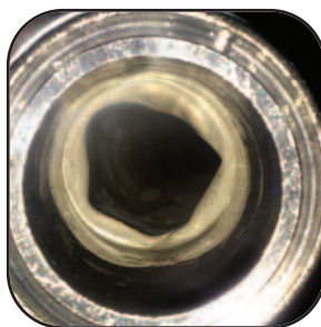
In-service competitor's hose assembly

With our extensive knowledge learned from the pharmaceutical industry, our hose assembly crimp technology offers smooth hose-to-fitting transitions, eliminating voids where beer spoiling bacteria can lurk and grow.