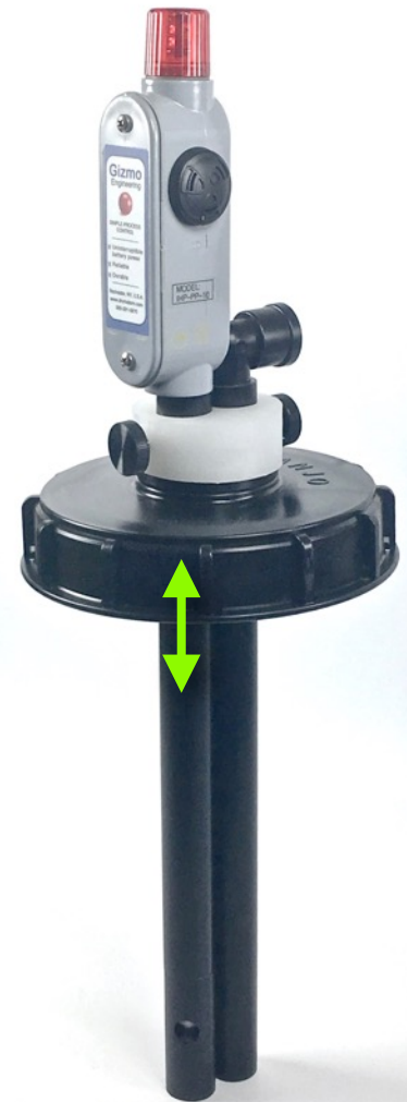
ADJUSTING THE DEPTH