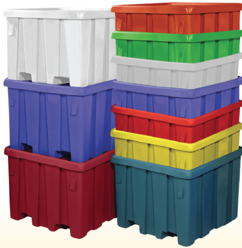
The P291 bulk forklift container handles products of all kinds and stacks covered, nests empty.