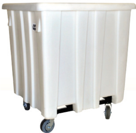
Optional casters allow manual handling when empty, optional fork safety tubes help secure load.

Overview: This rugged, durable bulk container made of High Density Polyethylene (HDPE) has features that contribute to easy lifting and storing and is taller than the P291.